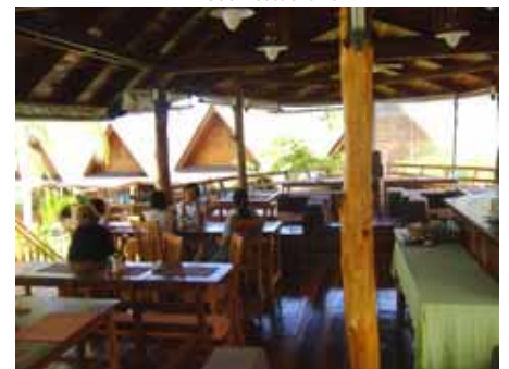
:: On the Boat Restaurant