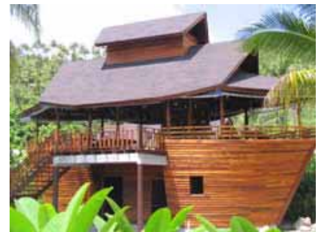
:: Boat Restaurant