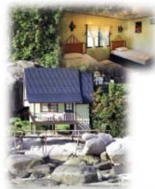
From top : Ko Nang Yuan: Once here the meaning of paradise is revealed; A bedroom of one of the bungalows at Ko Nang Yuan; Each bungalow has air conditioning

In fact, most of them headed for a larger island named Ko Tao (the Thai word for turtle), a Mecca for scuba-diving enthusiasts. It is only a 15-minute boat ride from Ko Nang Yuan. Ko Tao is a little more commercially developed and large enough to accommodate automobiles and motorcycles including 7-11 convenience store. You will find none of those reminders of civilisation at Ko Nang Yuan.