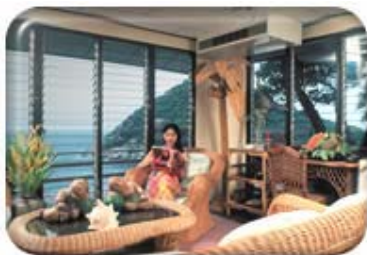
Sample as K9