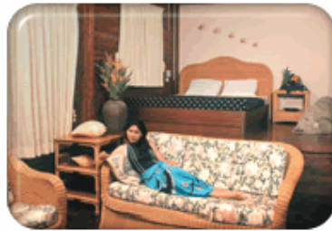
Sample as Q1