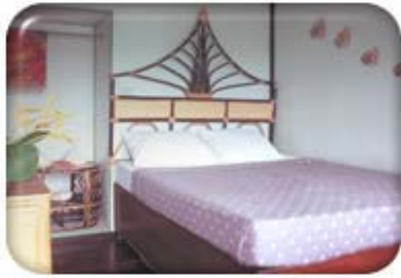
sample as A, F and D

För aktuella priser, klicka på länken "Priser" bredvid hotellnamnet