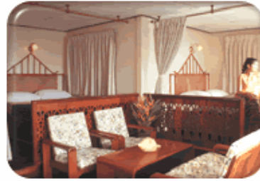
Sample as L4