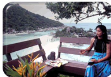
Sample as K9