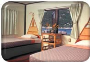
Sample as D6-D8