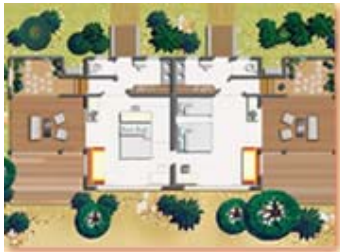
Superior & Deluxe Studios

Light structure buildings are the main components of the Boutique Resort common as well as accommodation buildings. In particular the bungalows are mostly open, turning the living room in to an open, covered seating area. Only the bed rooms are provided with air-condition. Bathrooms are semi-outdoor for the touch of nature feeling.